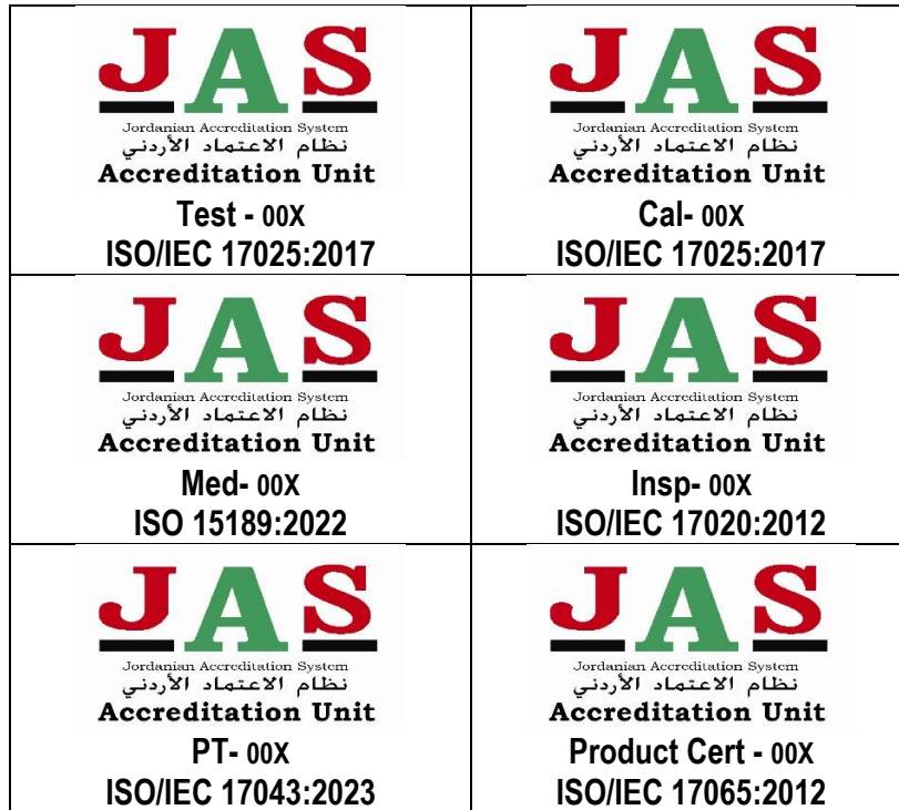
Figure 2 – Examples of JAS-AU Accreditation Symbols including the conformity assessment standard number

3.5 JAS-AU symbol used on reports/certificates should not be more prominent than the logo of the CAB, the CAB logo and JAS-AU symbol can be used concurrently.